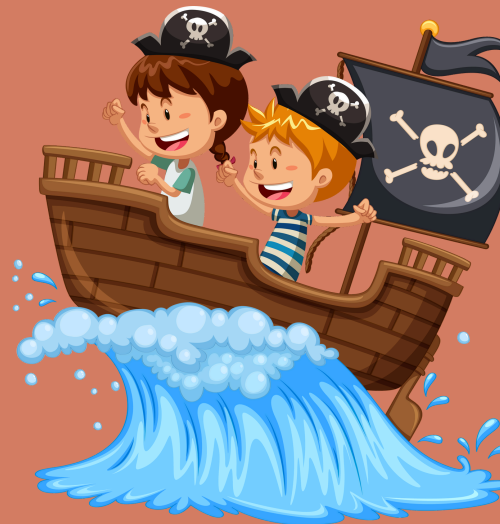
The PIRATE SHIP