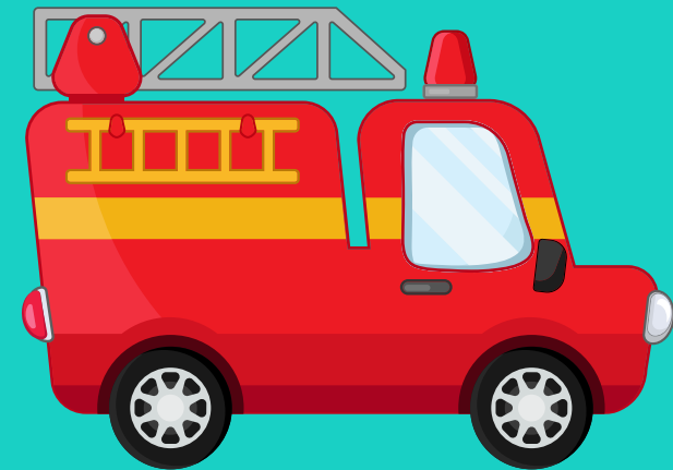
The FIRE TRUCK