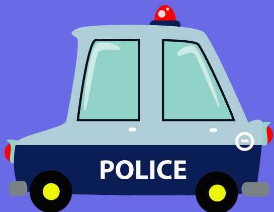
The POLICE CAR