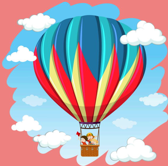
The HOT AIR BALLOON