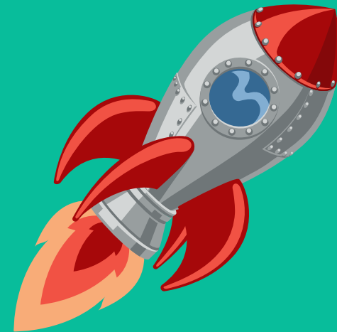
The ROCKET SHIP